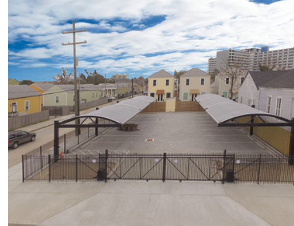
Thalia Parking Cost $183,600 New parking space, 2,000SF.