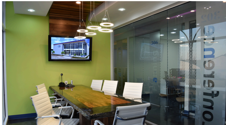
Colmex New Orleans Headquarters 8,000SF Renovation Cost: $1,120,000 Full renovation of an existing - 2 Story building that houses Colmex Headquarters