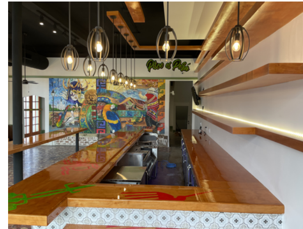
Tito's Ceviche Cost $718,812 Restaurant total renovation of 4,582 SF.