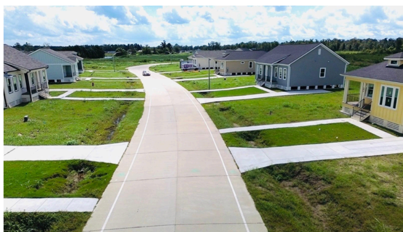
New Isle Project Cost $5,097,424 New 19 affordable homes