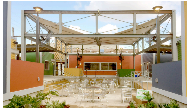
Good Work Network Culinary Incubator 3,000+- SF New Construction Cost $720,000 Construction of a new facility to house a culinary incubator.