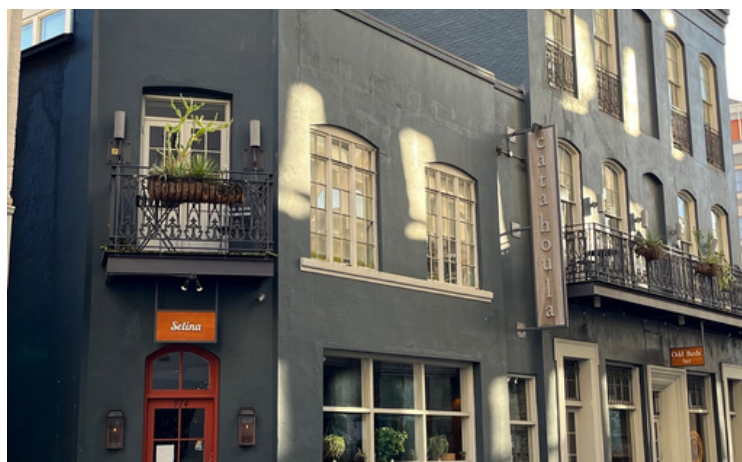
Catahoula Hotel Cost $502,918 Partial renovation of 15,000SF hotel.