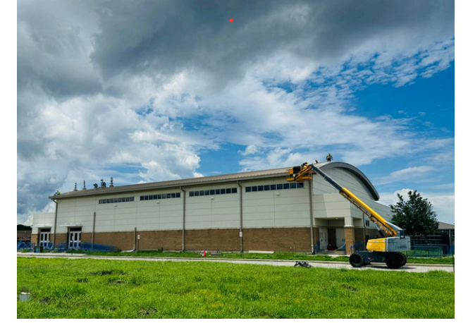
OPSB Lake Forest Cost $1,333,501 School Renovation after hurricane Damages