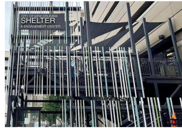
City of NOLA Low Barrier Shelter 40,000SF Renovation Cost $4,180,750 Interior built out to increase the current shelter's capacity by 200%.