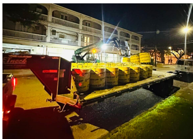
CNO MardiGras Parades Cost $100,379 MardiGras Parades infrastructure layout