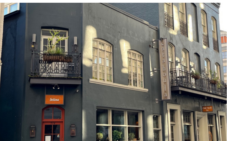
Catahoula Hotel Cost $502,918 Partial renovation of 15,000SF hotel.