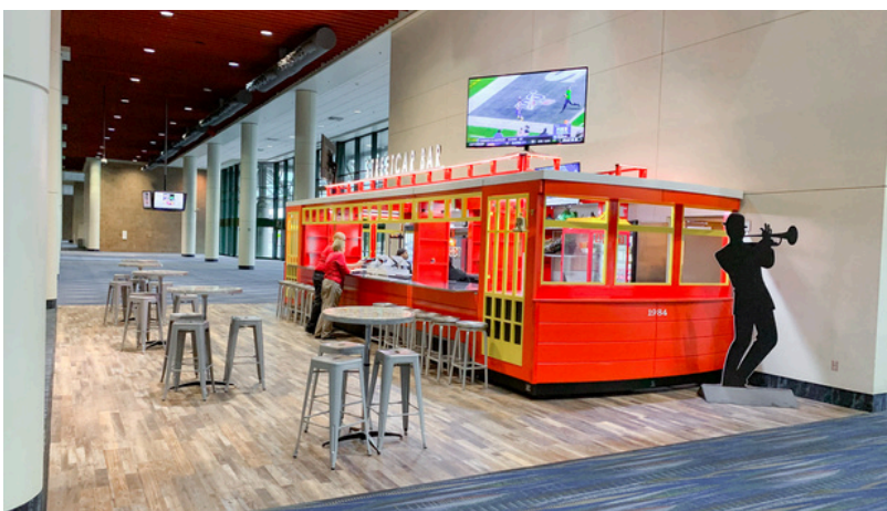
Convention Center Cost $138,420 Space renovation of new point of sale.