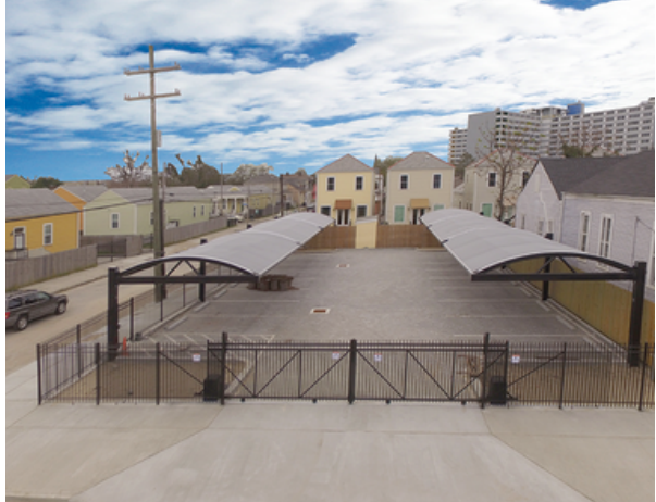
Thalia Parking Cost $183,600 New parking space, 2,000SF.