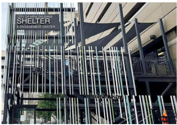
City of NOLA Low Barrier Shelter 40,000SF Renovation Cost $4,180,750 Interior built out to increase the current shelter's capacity by 200%.