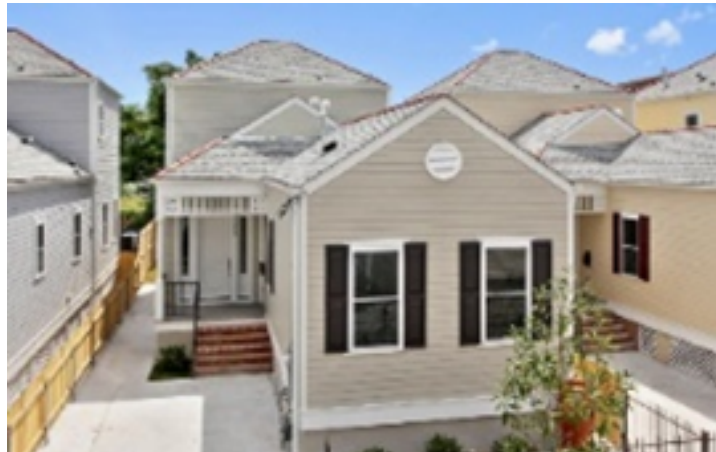
NORA; Saratoga Development Cost $1,546,363 2000SF Constructions of Energy Star and Green Communities.