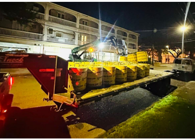
CNO MardiGras Parades Cost $100,379 MardiGras Parades infrastructure layout