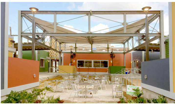
Good Work Network Culinary Incubator 3,000+- SF New Construction Cost $720,000 Construction of a new facility to house a culinary incubator.