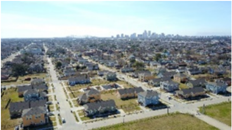
HANO, Florida and Guste Developments Cost $8,288,132 Correction and completion of 156 residential units.