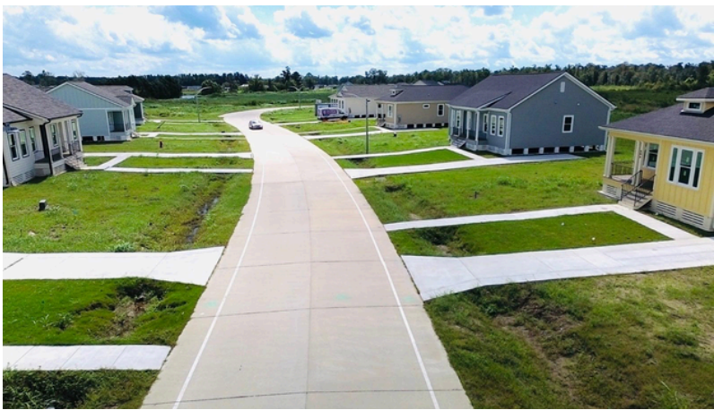
New Isle Project Cost $5,097,424 New 19 affordable homes