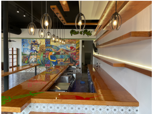
Tito's Ceviche Cost $718,812 Restaurant total renovation of 4,582 SF.