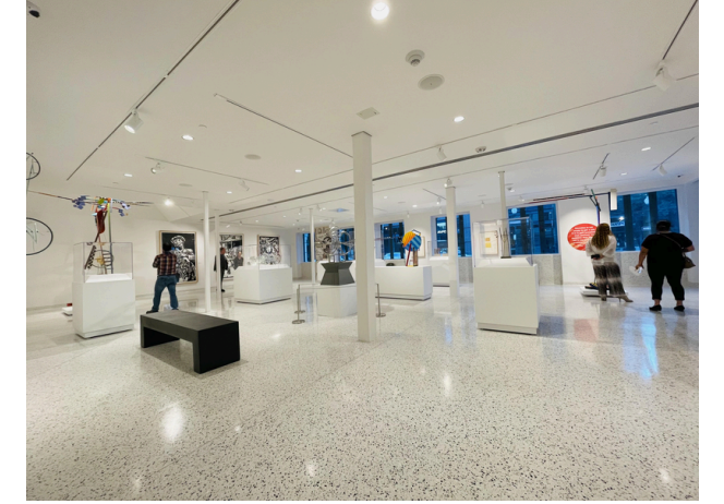
Helis Foundation Cost $1,222,302 Renovation of existing structure for gallery space. Approx 5800SF.