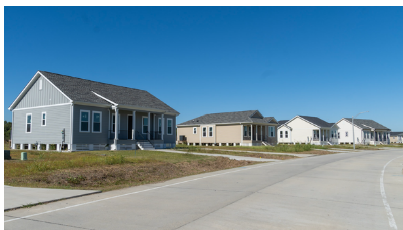
New Isle Project Cost $5,097,424 New 19 affordable homes.