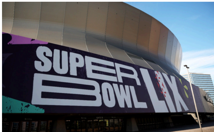
Superbowl LIX+ MardiGras Parades Cost $723,490 Modifications to the Caesars Superdome for Superbowl LIX.