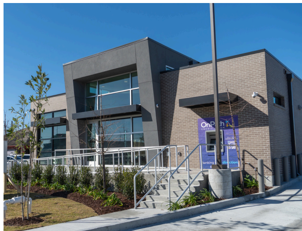
OnPath New Branch Cost $1,700,000 Construction of a New Credit Union Branch.