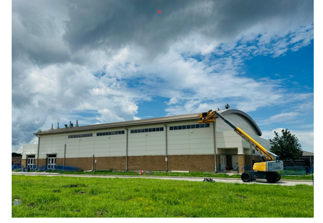
OPSB Lake Forest Cost $1,333,501 School Renovation after hurricane Damages.