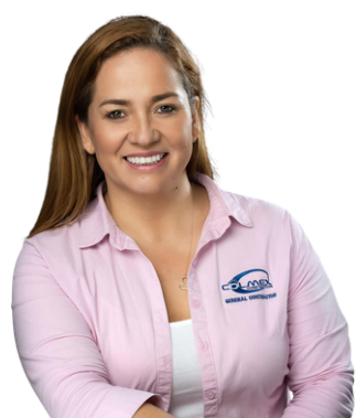
Angelica Rivera President